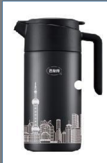
the Oriental Pearl Tower