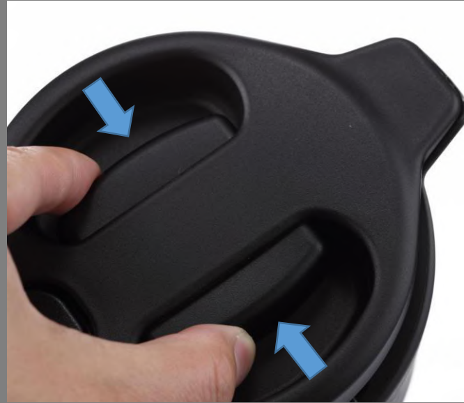
Pot lid With grab button