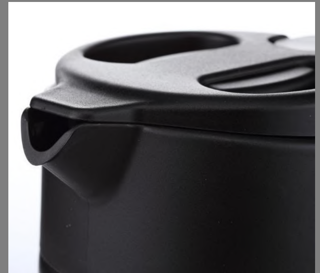
Outlet Anti-dripping design