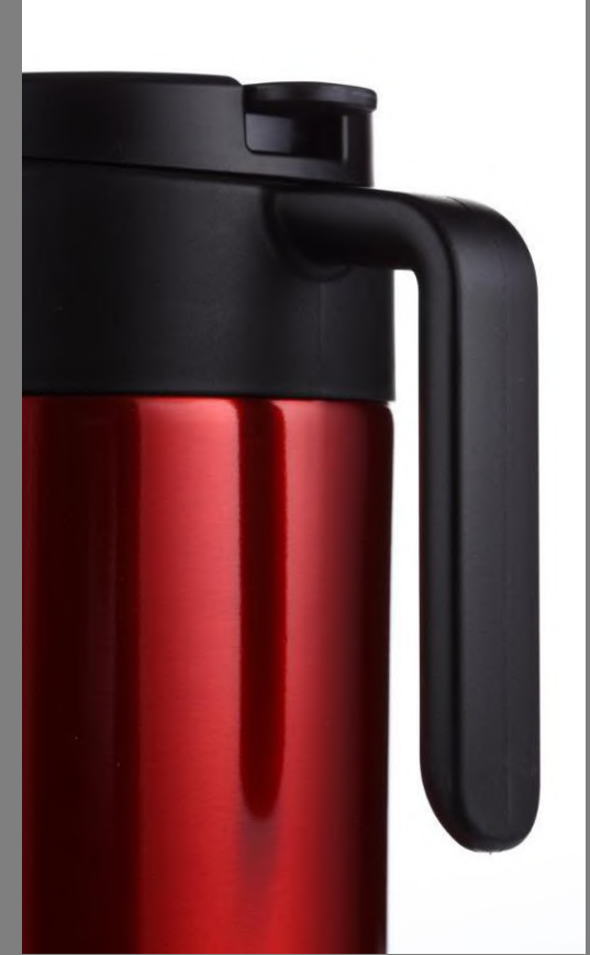
handle Not easy to break