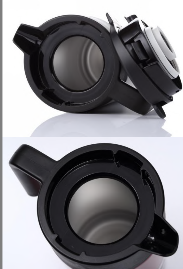
Large diameter Easy to water injection

It could be cleaned by dishwasher after test handle with R angle design disperse the stress and unlikely to be damaged by a fall